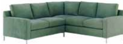
elton sectional: 87"w x 87"d x 36"h, LAF Loveseat + RAF Sofa w/ Return