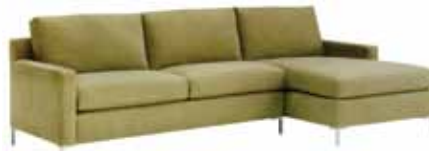
elton sectional: 119"w x 62"d x 36"h, LAF Sofa + RAF Chaise (2-cushion)