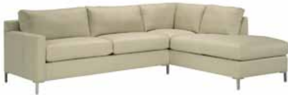
elton sectional: 112"w x 84"d x 36"h, LAF Sofa + RF Love w/ Bumper (2 -cushion) Shown in leather